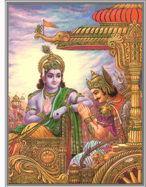
Krishna and Arjuna

Who is Krishna and what is his role as a spiritual guide? The answer is in his name itself. The word Krishna is derived from the Sanskrit verb root krsh , meaning that which draws, destroys. "The one who draws everything towards the Self or the one who destroys ignorance and the errors thereof."